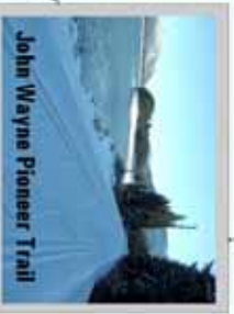
John Wayne Pioneer Trail groomed with a skate lane and set with dual tracks. 7.6 miles one way from Hyak south to Stampede Pass Rd.