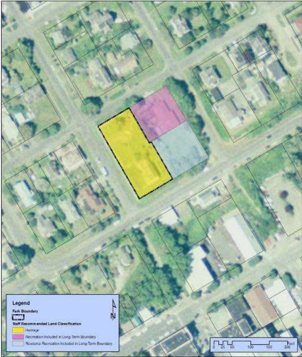
Figure 1 Rothschild House Land Classification and Long-Term Boundary Staff Recommendation